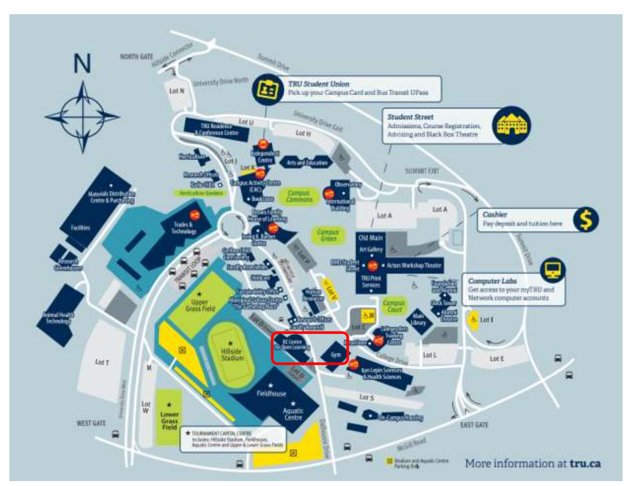
Figure 2.1 TRU Kamloops Campus Layout & Gym and CAC Building